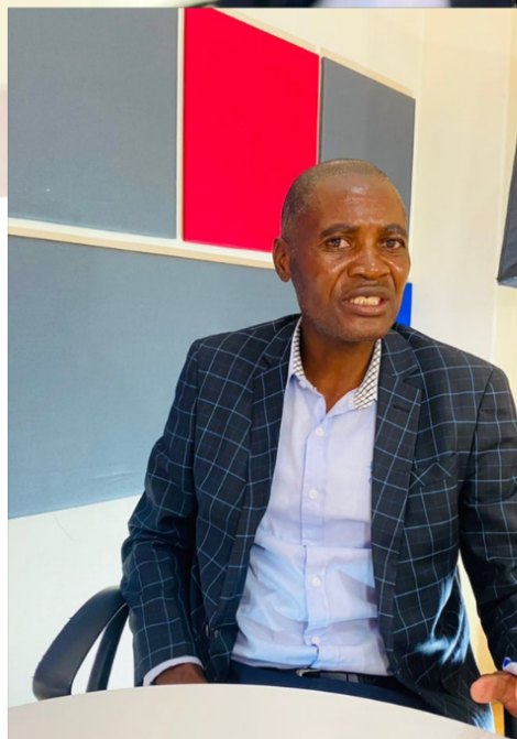
ZENZEZA WEST COUNCILLOR